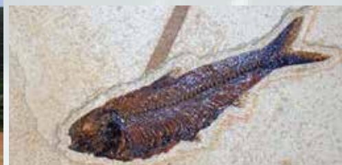
Fossil from Fossil Butte